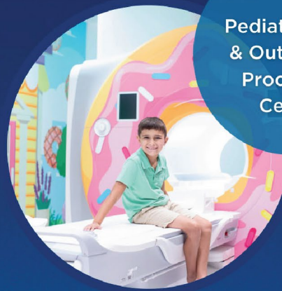
Pediatric MRI & Outpatient Procedure Center